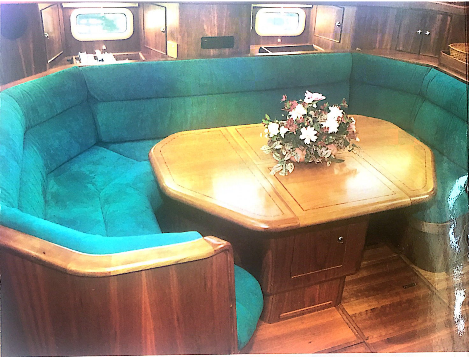
Above: Saloon wrap around settee seats six in comfort, with deluxe table option.