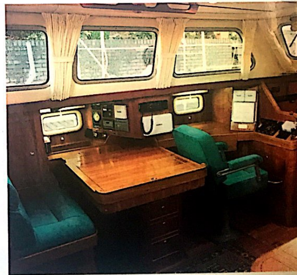
Please note that layouts may vary and some photos may