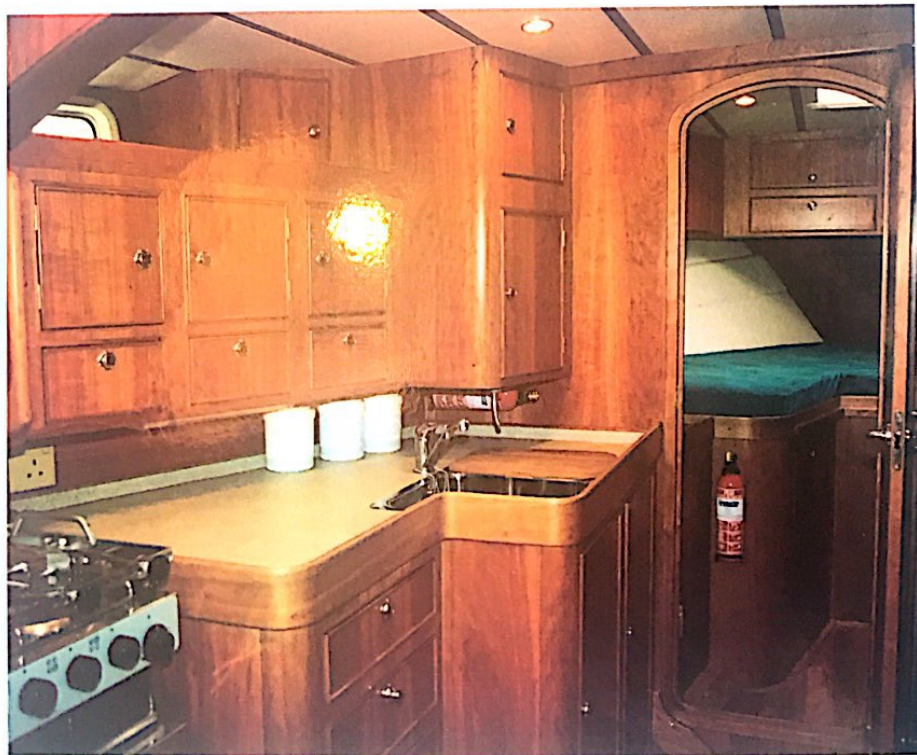
Above: Full sized galley, semi open plan with saloon. Generous well divided lockers and drawers - double sinks - two large working surfaces (one shown) - three burner stainless grill/oven/cooker.